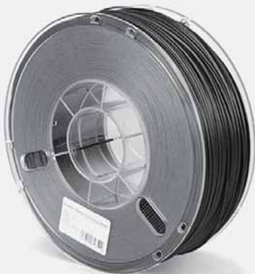
Raise3D Industrial PA12 CF Filament