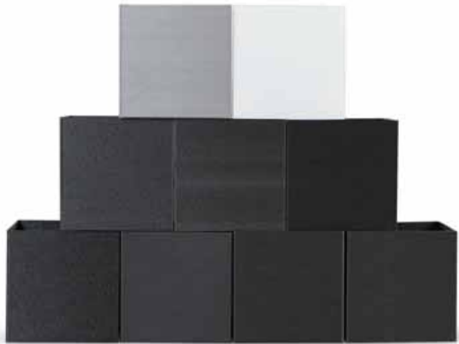
High-Performance Carbon Fiber Filaments Certified by the Raise3D OFP Program

The E2CF is compatible with the Raise3D Industrial PA12 CF Filament, and is also very compatible with high-performance carbon fiber filaments certified by the Raise3D OFP program, such as PA / PPS / PETG and some other high-performance carbon fiber composite filaments from BASF and LEHVOSS.